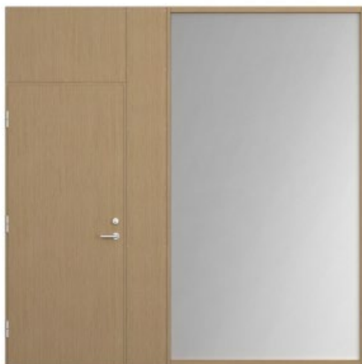
Acoustic Partition With Rw37dB Door