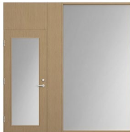
Acoustic Partition With Rw37dB Glazed Door